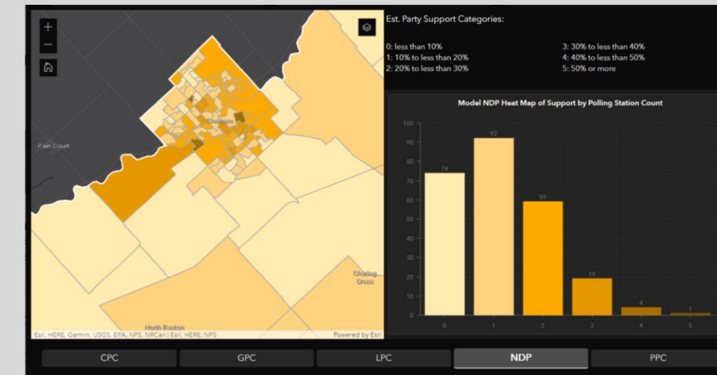
Party Heat Maps of Support