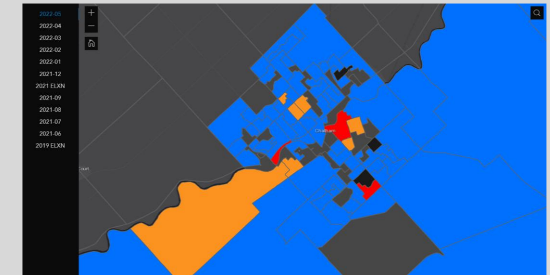
Model Estimate Map Series Trends