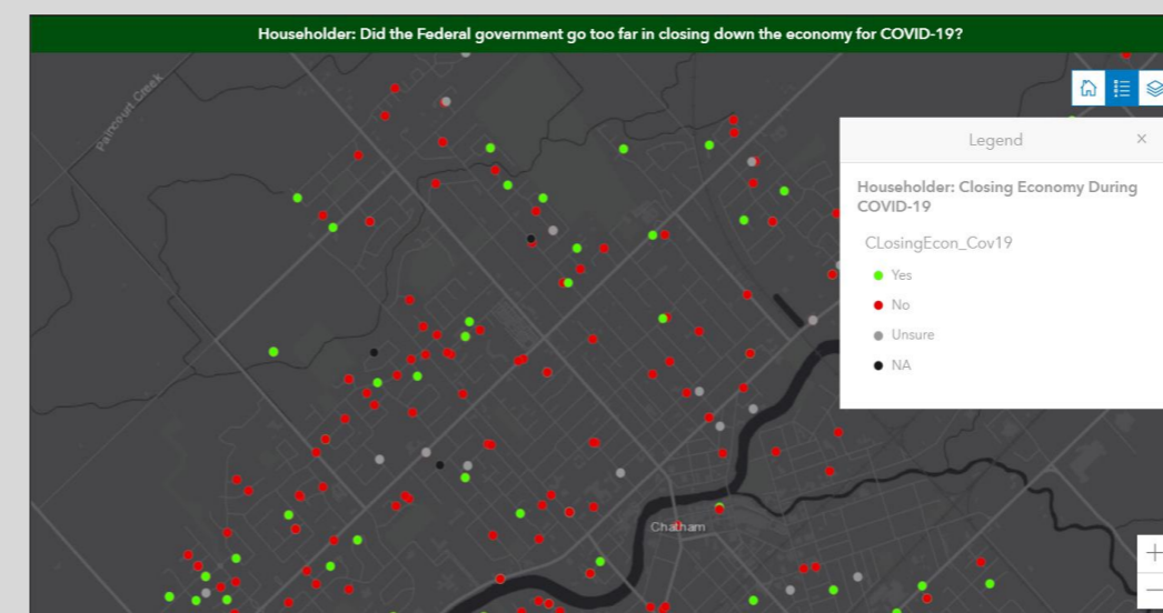
Visualized Constituency Householder Data